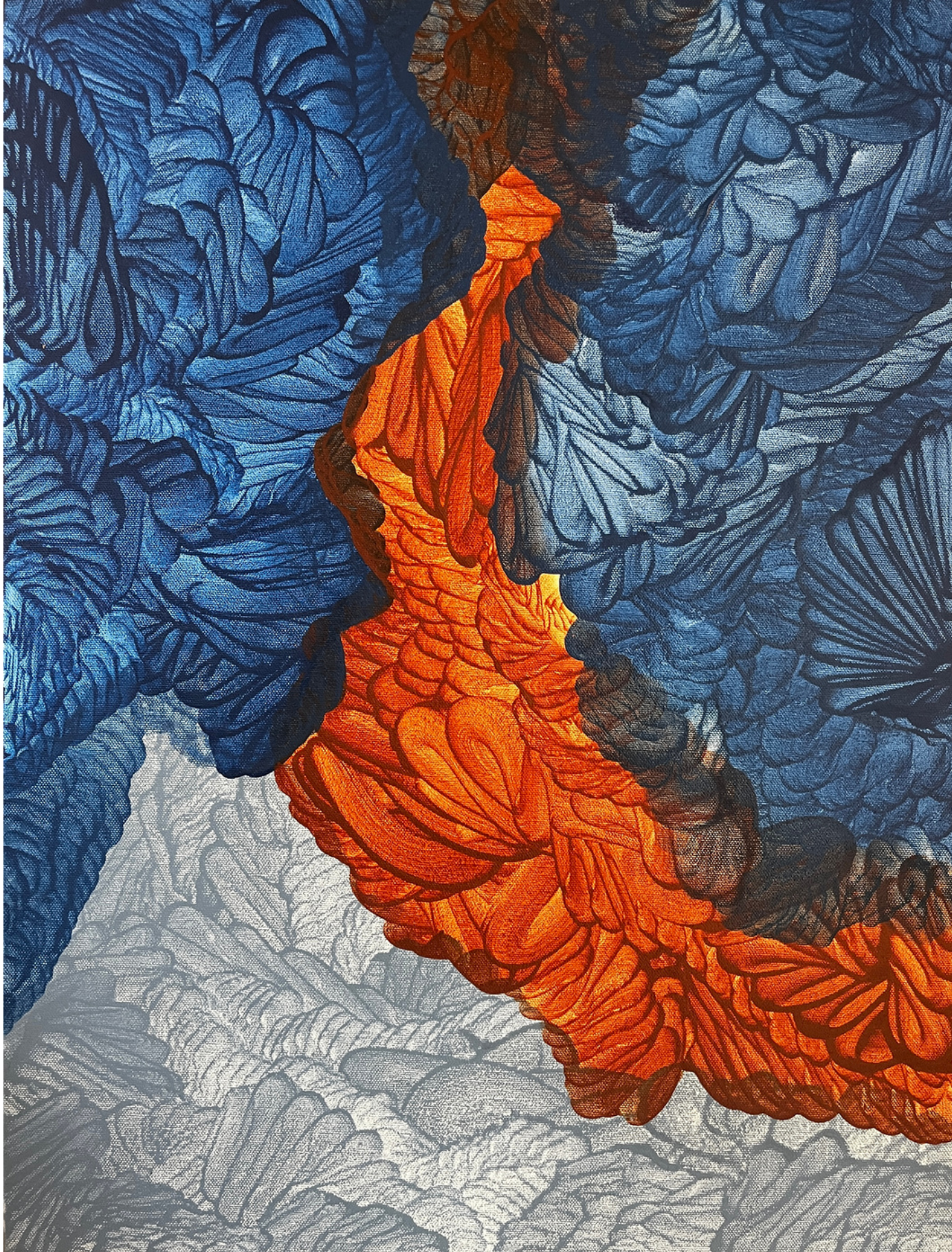
Mangni I Acrylic on Canvas 24 x 18" USD 1890