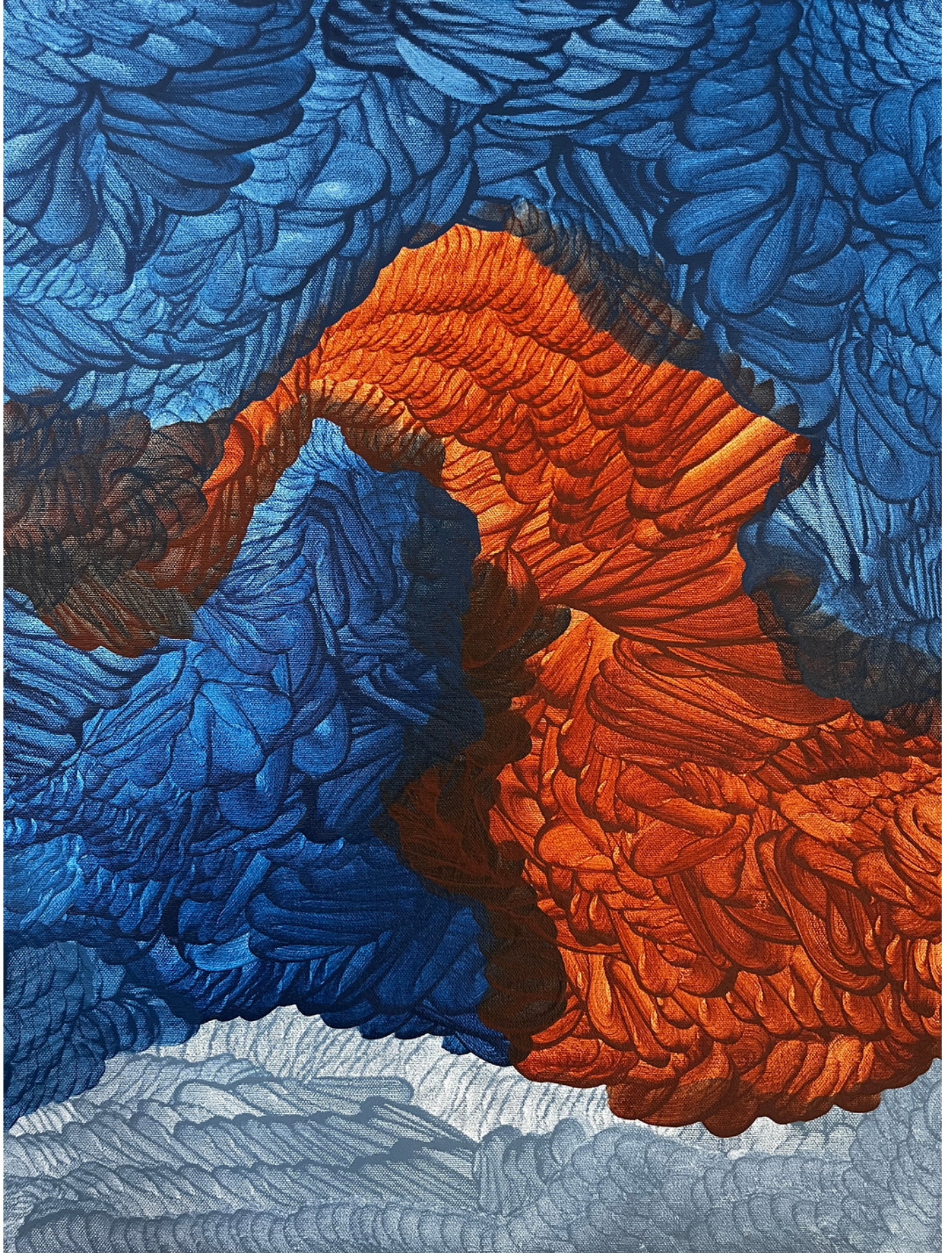
Mangni III Acrylic on Canvas 24 x 18 USD 1890