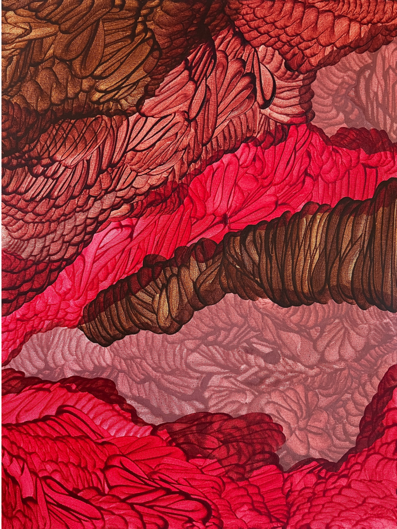
Sindoor III Acrylic on Canvas 24 x 18" USD 1890