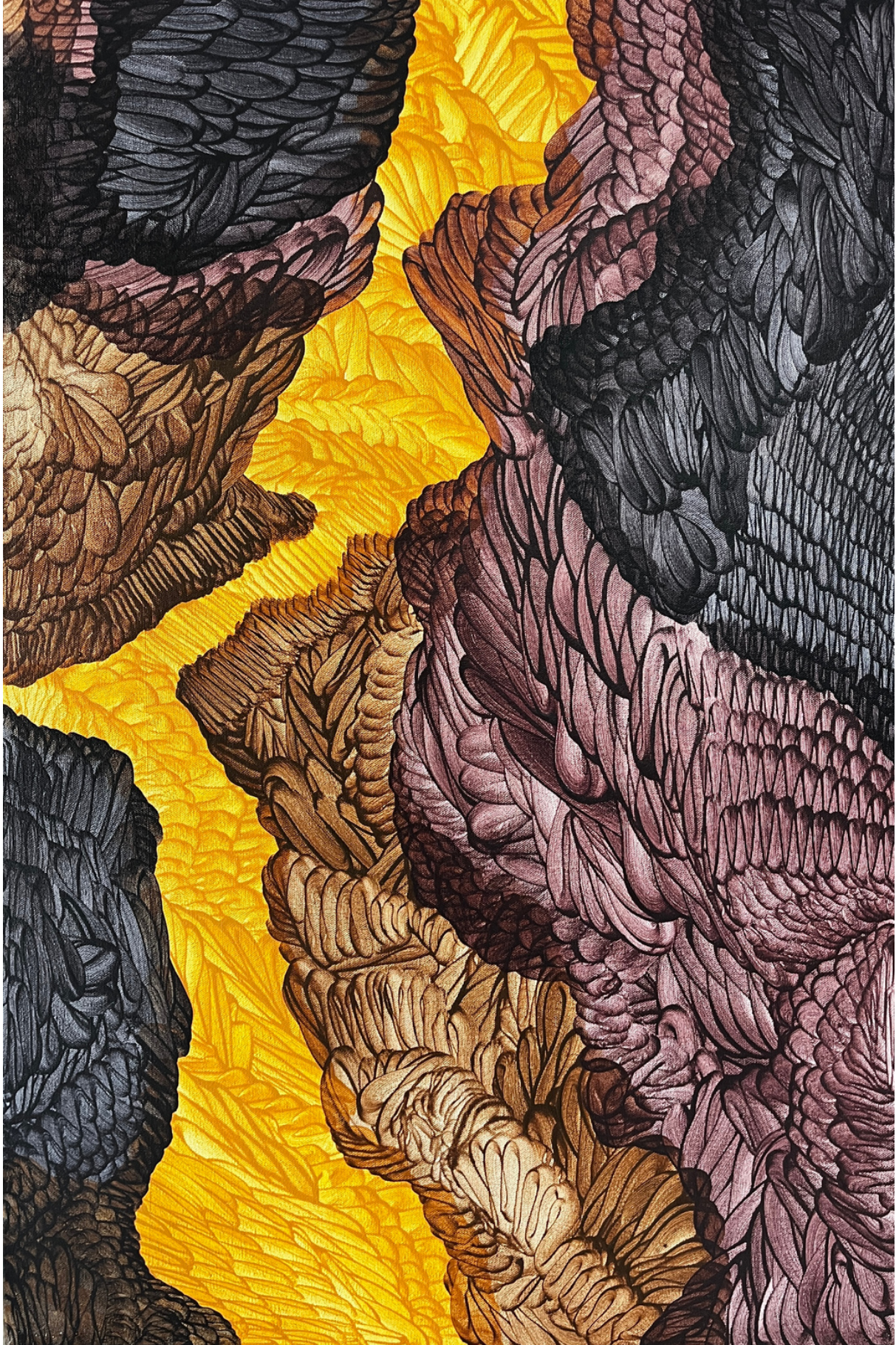
Gaur I Acrylic on Canvas 36 x 24" USD 2700