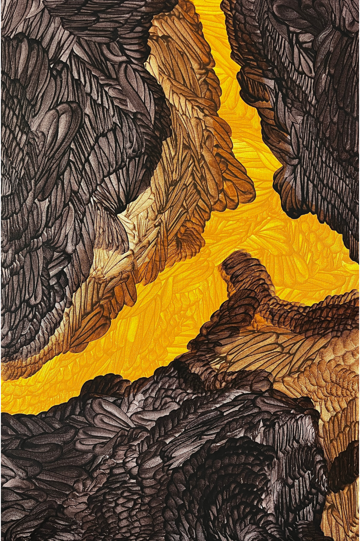
Tel Baan II Acrylic on Canvas 36 x 24" USD 2700