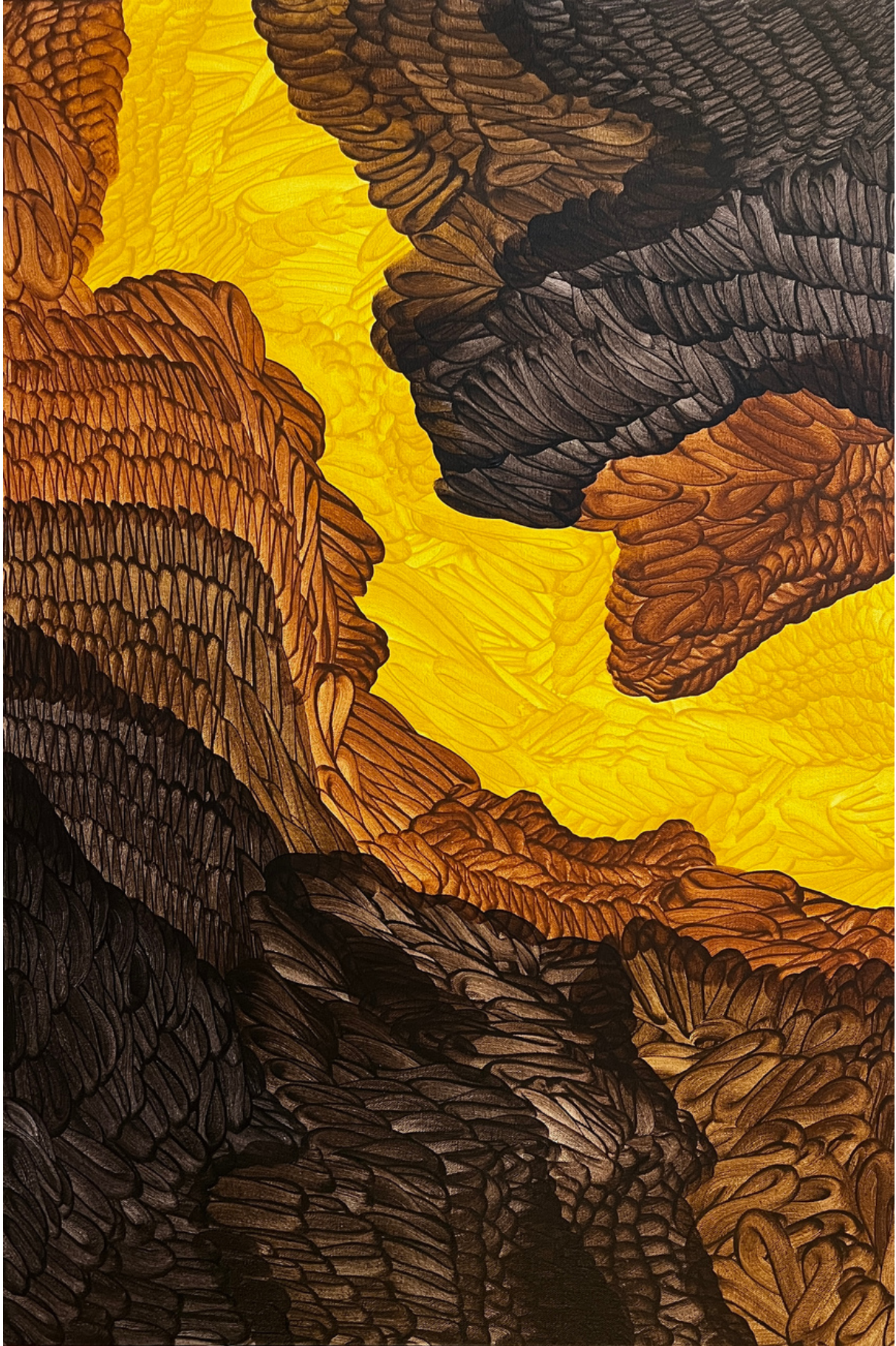
Tel Baan I Acrylic on Canvas 36 x 24" USD 2700