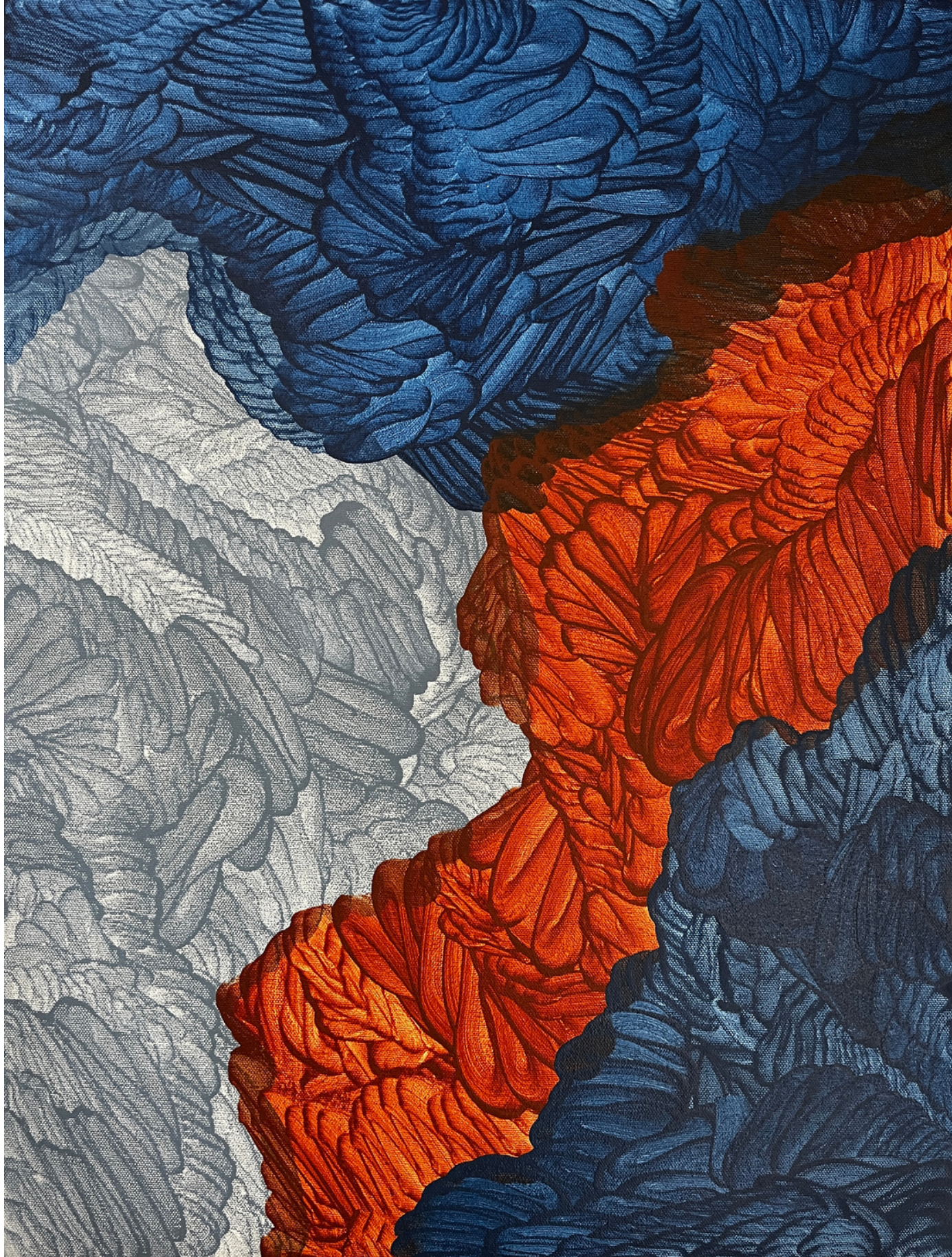
Mangni II Acrylic on Canvas 24 x 18" USD 1890