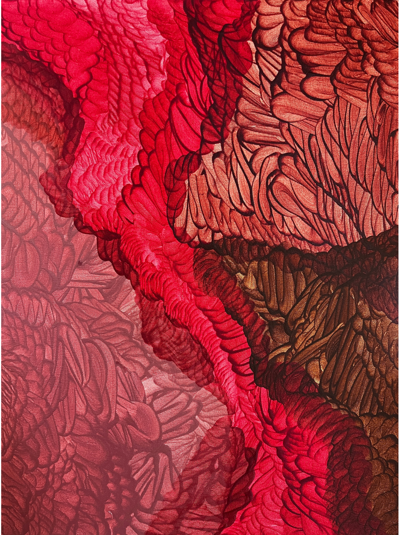
Sindoor II Acrylic on Canvas 24 x 18" USD 1890