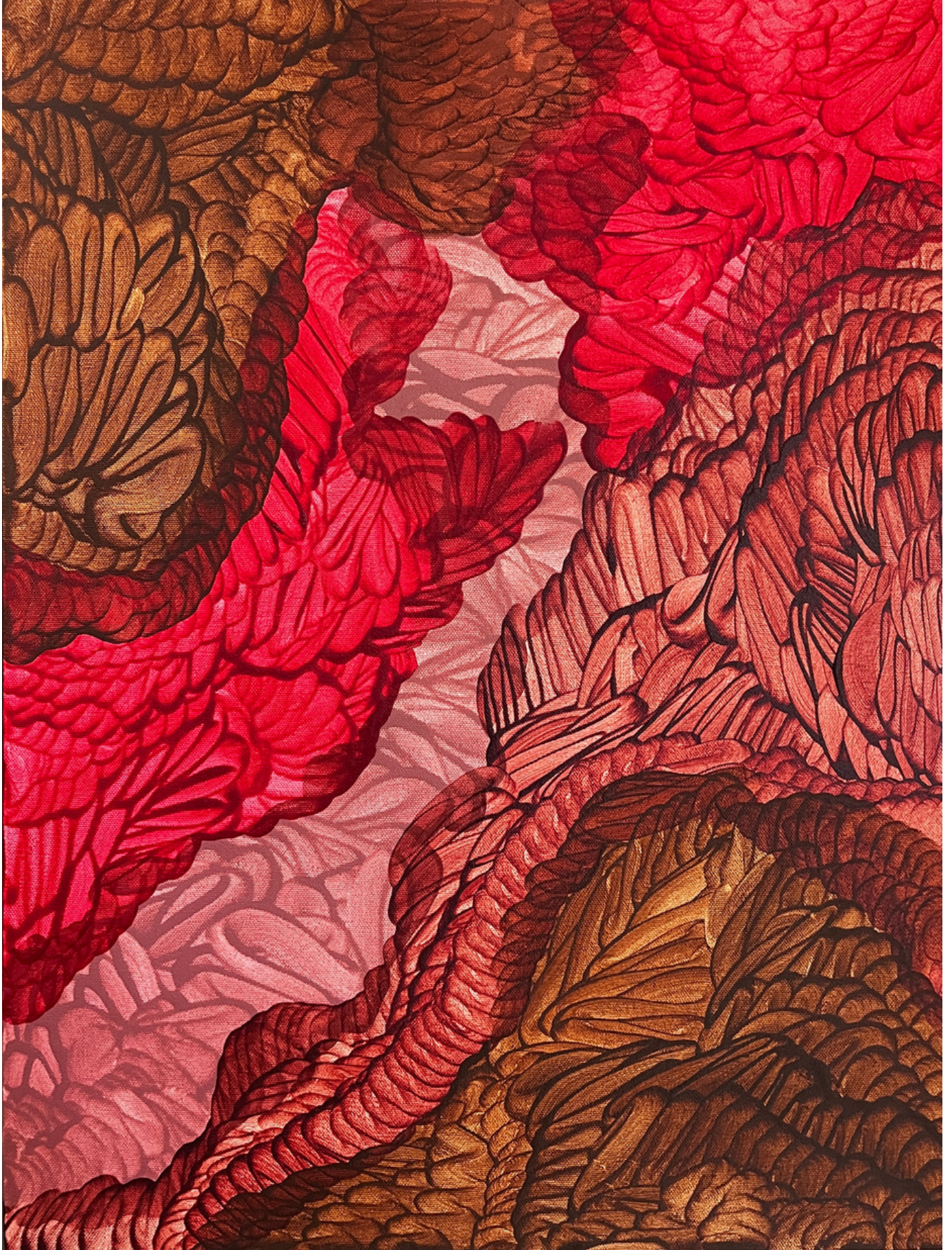
Sindoor I Acrylic on Canvas 24 x 36" USD 1890