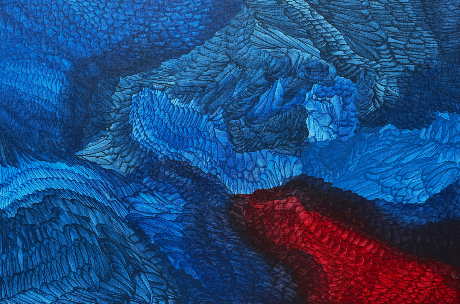
Baraat Acrylic on Canvas 24 x 36" USD 3600

This is a captivating artwork that embodies the cultural tradition of the groom's procession, often accompanied by a horse, to wed the bride. The artist's wedding day is vividly portrayed against a backdrop of beautifully serene blue, signifying the ideal weather for such a significant event. The use of red resonates deeply with the essence of marriage in India. This artwork encapsulates the most beautiful and life-changing moment of the artist's journey, capturing the joy and transformation that come with union and celebration.