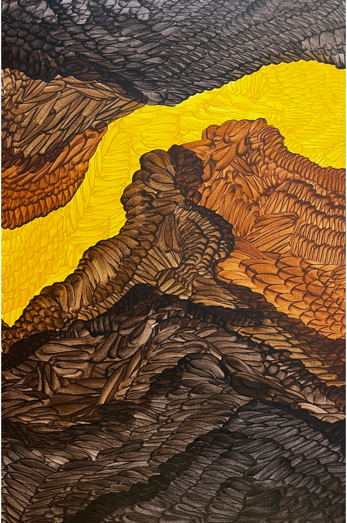
Gaur II Acrylic on Canvas 36 x 24" USD 2700